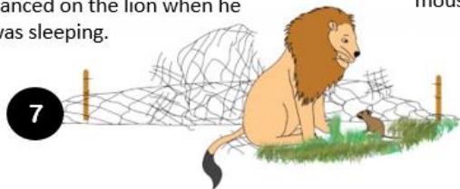
7 The lion and the mouse became friends.