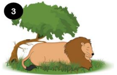
3 The lion had a big meal and fell asleep under the tree.