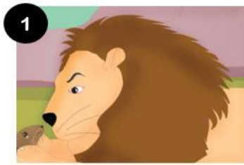
1 The lion caught the mouse.