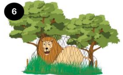
6 The hunters caught the lion in the net.