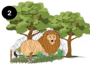
2 The mouse helped the lion.